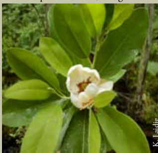
Sweet Bay Magnolia - fragrant, tree