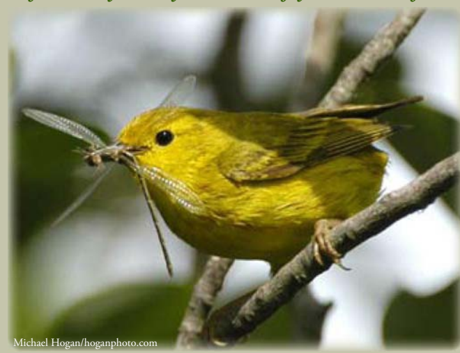
Yellow Warbler with Dragonfly

Remember, gardening is a gradual, evolving process of discovery. Take your time, enjoy it and have fun!