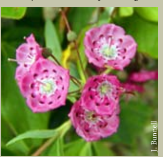
Sheep Laurel - low, evergreen