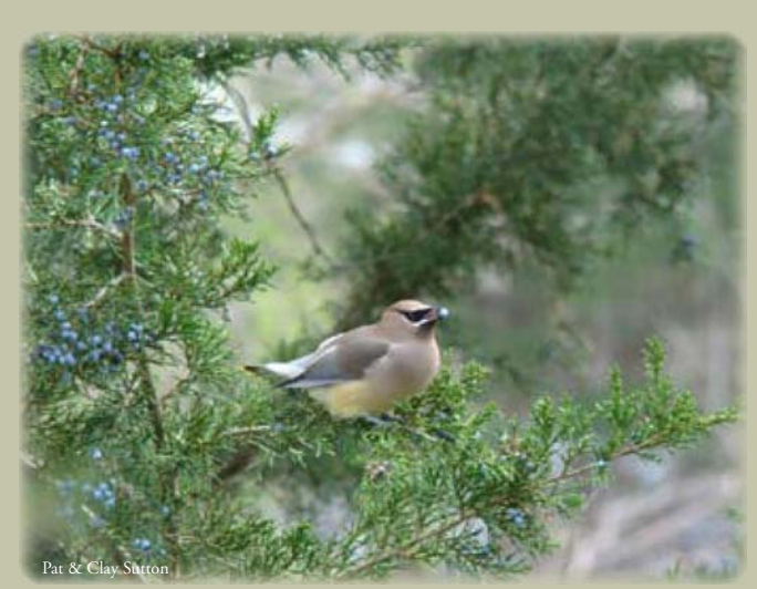
Cedar Waxwing eating Red Cedar berries

For more information contact: The Pinelands Commission P.O. Box 359, New Lisbon, NJ 08064 (609) 894-7300 Or log on to www.nj.gov/pinelands