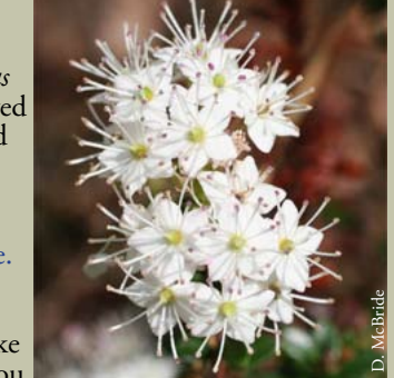
Sandmyrtle - low, compact evergreen