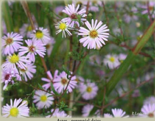
Aster - perennial daisy

Remember, gardening is a gradual, evolving process of discovery. Take your time, enjoy it and have fun!